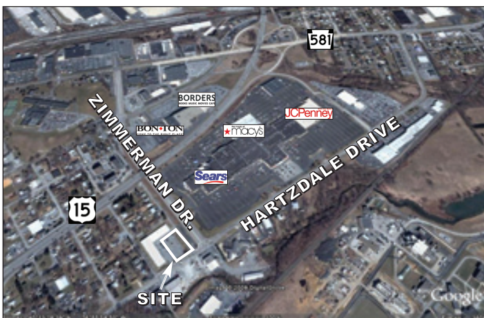
Hartzdale & Lower Allen Drive, Camp Hill, PA