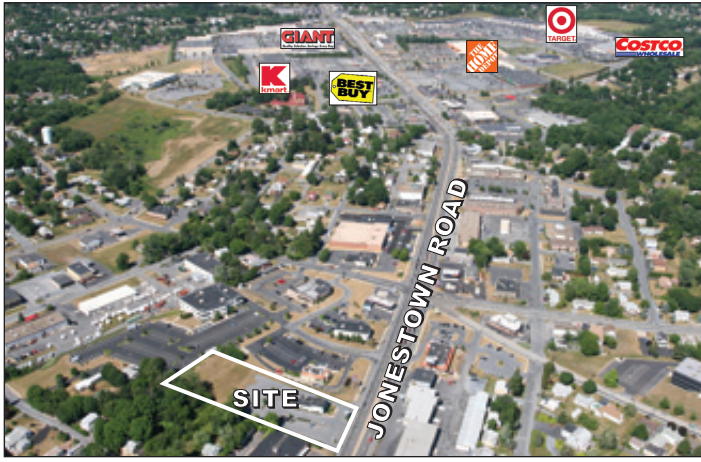
4636 Jonestown Road, Harrisburg, PA