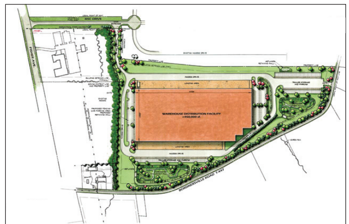
I-81 & I-78, Lickdale, PA