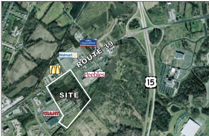
Rt. 30 & Rt. 15 – Gettysburg Station, Gettysburg, PA