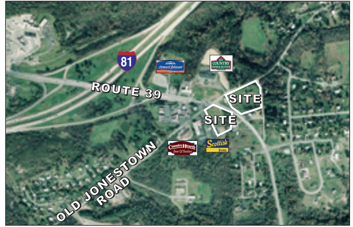
Rt. 39 & Old Jonestown Road, Harrisburg, PA